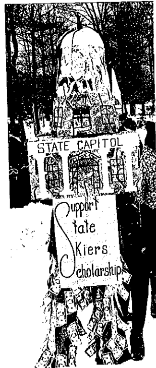
Above: Ski Club lays 50' candy striped Easter Egg. Below left: First Prize Easter Costume with political overtones. Below center: New Sugar House at base of Nose Dive where 20 gallons of maple syrup were consumed as "sugar on snow" during annual Sugar Slalom. Right: Ski Patrolman jumps for joy.