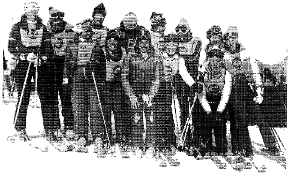
The MMSC Grand Marnier racers at Keystone.